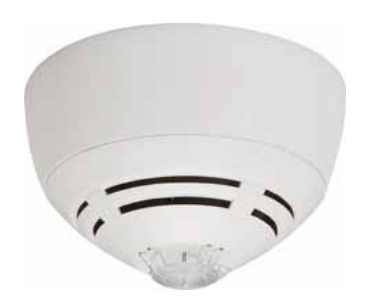
Wireless gateway with IQ8Quad detector